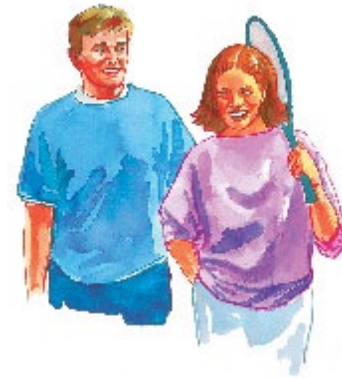
Learn to laugh and enjoy wholesome times together.

Comment: Overdoing will ruin your marriage. So will underdoing. Work, love, rest, exercise, play, worship, meals, and social contacts must be carefully balanced in your marriage, or something will snap. Overwork and the lack of sleep, proper food, or exercise make a person critical, intolerant, and negative. Constant overeating is a great evil that strengthens the lower nature and dulls the conscience. Sexual abuses destroy a love for holy things and weaken vitality. Marriage gives no license to sexual excesses. Degrading, twisted, or intemperate sex acts destroy love and