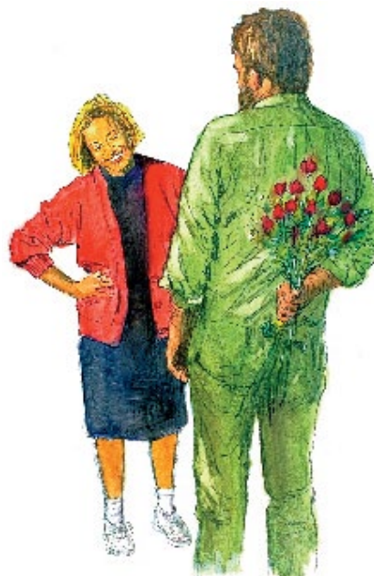
Surprise each other with little gifts.