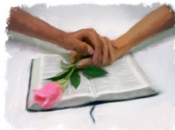
Never forget that God Himself joined you in marriage.

marriage. Keep love growing by expressing love for one another or it will die, and you will drift apart. Love and happiness are not found by seeking them for yourself, but rather by giving them to others. So spend as much time as possible doing things together if you would get along well. Learn to greet each other with enthusiasm. Relax, visit, shop, sightsee, eat together. Don't overlook the little courtesies, encouragements, and affectionate acts. Surprise each other with little gifts or favors. Try to "out-love" each other. Don't take more out of marriage than you put into it. Divorce itself is not the greatest destroyer of marriage, but rather, lack of love. Given a chance, love always wins.