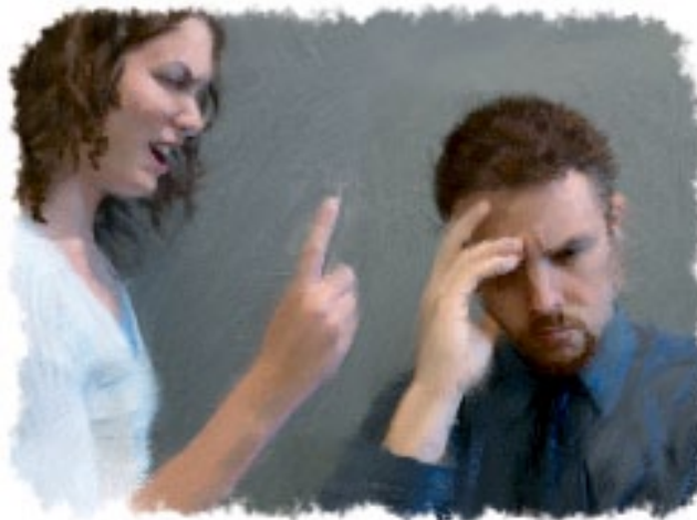
Harsh, angry words crush your spouse’s desire to please you.

“A soft answer turns away wrath, but a harsh word stirs up anger” (Proverbs 15:1). “Live joyfully with the wife whom you love” (Ecclesiastes 9:9). “When I became a man, I put away childish things” (1 Corinthians 13:11).