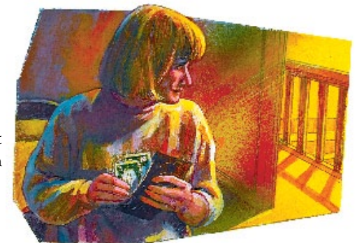
Do not tamper with each other’s wallets or other personal property without permission.

Comment: Each spouse has a God-given right to certain personal privacies without explanation. Do not tamper with each other’s wallets or purses, personal mail, and other private property unless given permission. The right to privacy and quietude when preoccupied should be respected. Your husband or wife even has a right to be wrong part of the time and is entitled to an “off-day” without being given the third degree. Marriage partners do not own each other and should never try to force personality changes. Only God can make such changes, and we shall all answer personally to Him on this matter (Romans 14:12). Perfect confidence and trust in one another—no checking up on each other—is absolutely essential for happiness. Spend less time trying to “figure out” your spouse and more time trying to please her or him. This works wonders.