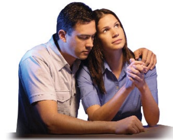
Pray aloud for each other.