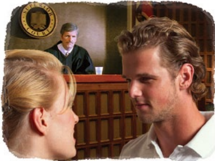
Forgiveness is always better than divorce.

reason Jesus ruled it out. Divorce is always destructive and almost never a solution to the problem. Instead, it creates much greater problems, so it should never be considered. Torn, frustrated, unhappy, twisted lives almost inevitably follow divorce, and even success in life itself is often thwarted. God instituted marriage to guard people’s purity and happiness, to provide for their social needs, and to elevate their physical, mental, and moral nature. Its vows are among the most solemn and binding obligations that human beings can assume. To lightly set them aside results in removing one’s self from God’s favor and blessing.