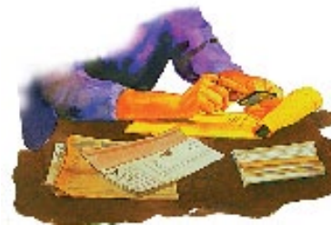
Discuss and agree in money matters.

Comment: All possessions and income in marriage should be “ours,” not “yours” and “mine.” Wives who don’t work outside the home should receive a regular amount for groceries, clothing, and other budgeted items. It should be cheerfully provided instead of grudgingly released under protest. Wife and husband both should have small, equal sums (whenever possible) to spend as desired without giving account. A miserly husband usually angers his wife into being a spender, just as a wasteful husband makes a wife stingy. Showing confidence in your companion’s managing ability will usually make him or her more businesslike.