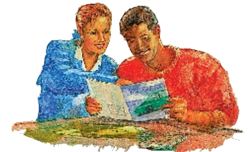
Talking things over together will avoid many blunders that could destroy your marriage.

Comment: Few things will strengthen your marriage more than counseling together on all major decisions. Changing a job or purchasing a home, an automobile, a boat, furniture, clothing (major items at least), and all other items that require money involve both husband and wife, and the opinions of both should be considered. Talking things over together will avoid many blunders that could ruin your marriage. If, after much discussion and earnest prayer, opinions still differ, the wife should submit to her husband’s decision. Scripture is clear on this. (See Ephesians 5:22-24.)