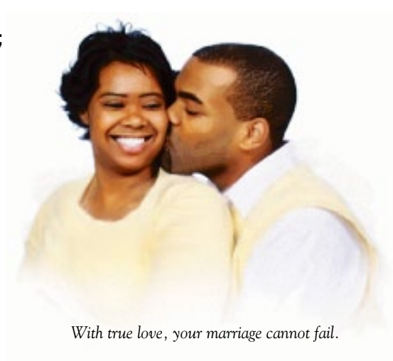
With true love, your marriage cannot fail.

Comment: Please reread the above Scripture passage carefully. This is God’s true description of love. How do you measure up? Love is not a sentimental impulse, but a holy principle that involves every phase and action of life. With true love, your marriage cannot fail. Without it, it cannot succeed.