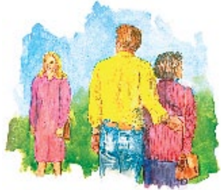
The wrong kind of thinking can destroy your marriage.

“For as he thinks in his heart, so is he” (Proverbs 23:7). “You shall not covet your neighbor’s wife” (Exodus 20:17). “Keep your heart with all diligence, for out of it spring the issues of life” (Proverbs 4:23). “Whatever things are true, ... noble, ... just, ... pure, ... lovely, ... of good report, ... meditate on these things” (Philippians 4:8).