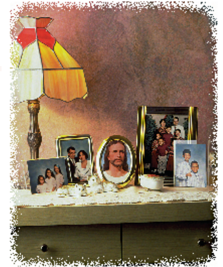
With Christ in your hearts and home, marriage will be successful.

Comment: This is the greatest rule. It really covers all the others. Put Christ first! The real secret of true happiness in the home is not diplomacy, strategy, and untiring effort to overcome problems, but rather, union with Christ. Hearts filled with Christ’s love can never be very far apart. With Christ in the home, marriage will be successful. The gospel is the cure for all marriages that are filled with hatred, bitterness, and disappointment. It prevents thousands of divorces by miraculously restoring love and happiness. It will save your marriage, too, if you are willing.