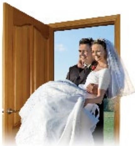
Establish your own home, even if it must be a one-room apartment.