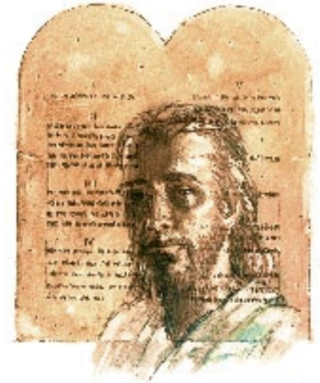
Jesus is the law in human form. When He is in the heart, keeping the law becomes a pleasure.

Answer: No, indeed! Jesus specifically asserted that He did not come to destroy the law, but to fulfill (or keep) it. Instead of doing away with the law, Jesus magnified it (Isaiah 42:21) as the perfect guide for right living. For example, Jesus pointed out that "You shall not murder" condemns anger "without a cause" (Matthew 5:21, 22) and hatred (1 John 3:15), and that lust is adultery (Matthew 5:27, 28). He says, "If you love Me, keep My commandments" (John 14:15).