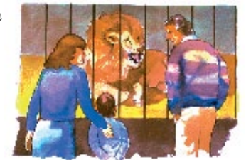
The law protects us from the devil as a cage protects us from the lion at the zoo.

Answer: Because the Ten Commandment law is the standard by which God examines people in the heavenly judgment. How are you measuring up? It is a life-or-death matter!