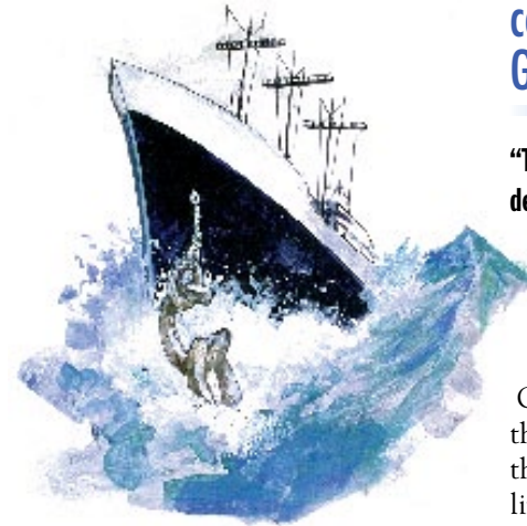
The law is like a length of chain. If only one link is broken, its entire purpose is undone.

Answer: The Ten Commandment law is the guide we must use in finding our way to God and holy living. If I ignore even one of the commandments, I am neglecting part of the divine pattern, or blueprint. If only one link of a chain is broken, its entire purpose is undone. The Bible says that when we knowingly break any command of God, we are sinning (James 4:17), because we have refused His will for us. Only those who do His will can enter the kingdom of heaven. Of course, God will forgive anyone who genuinely repents and accepts Christ's power to change.