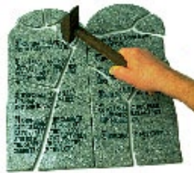
God says that sin is breaking His law.

Answer: Sin is breaking God's Ten Commandment law. And since the law of God is perfect (Psalm 19:7), its principles cover every conceivable sin. It is impossible to commit a sin that is not condemned by at least one of God's Ten Commandments. The commandments cover "man's all [the whole duty of man]" (Ecclesiastes 12:13). Nothing is left out.