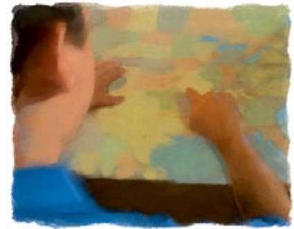
God's law is His road map to happy, abundant living.

Special Note: The eternal principles of God's law are written deep in every person's nature by the God who created us. The writing may be dim and smudged, but it is still there. This means, of course, that you cannot find true peace unless you are willing to live in harmony with your inner nature, upon which God has written these principles. We were created to live in harmony with them. When we choose to ignore them, the result is always tension, unrest, and tragedy—just as ignoring the rules for safe driving leads to serious trouble.