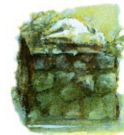
Ceremonial sacrifices and rituals pointed forward to Jesus' sacrifice.

Note: Moses' law contained the temporary, ceremonial law of the Old Testament. It regulated the priesthood, sacrifices, rituals, meat and drink offerings, etc., all of which foreshadowed the cross. This law was added "till the seed should come," and that seed was Christ (Galatians 3:16, 19). The ritual and ceremony of Moses' law pointed forward to Christ's sacrifice. When He died, this law came to an end, but the Ten Commandments (God's law) "stand fast forever and ever" (Psalm 111:8). That there are two laws is made crystal clear in Daniel 9:10, 11.