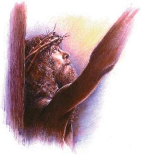
The cross is positive proof that the law is unchangeable.

Notice on the above chart that God and His law have the same characteristics. Do you see what this means? The Ten Commandment law is God's character in written form—written so we can comprehend it. It is no more possible to change God's law than to pull God out of heaven and change Him. Jesus came to show us what the law (which is the pattern for holy living) looked like when made up in human form. God's character can never change. Neither can His law, for it is His character in human language.