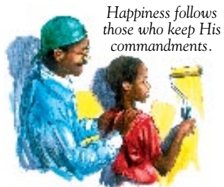
Happiness follows those who keep His commandments.