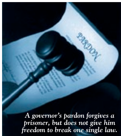
A governor's pardon forgives a prisoner, but does not give him freedom to break one single law.

Answer: No! The Scriptures teach the very opposite. Grace is like the governor's pardon to a prisoner. It forgives him, but it does not give him freedom to break one single law on the statute books. The forgiven person, living under grace, is under double obligation to keep the law. A person who refuses to keep God's law, saying that he is living under grace, is mistaken. He is living under disgrace .