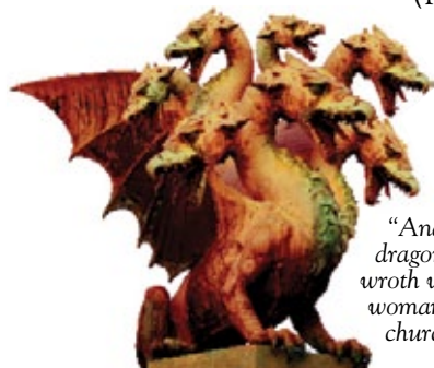
"And the dragon was wroth with the woman [true church]."

Answer: The devil hates the people who uphold God's law because the law is the pattern of right living. And if you decide to follow the pattern outlined in God's law, you will feel the devil's wrath upon you at once and with all fury. It is not surprising that the devil hates and bitterly opposes all who uphold God's law. But it is shocking and astounding to hear religious leaders denying the binding claims of the Ten Commandments while at the same time upholding the traditions of men. No wonder Jesus said, "Why do you also transgress the commandment of God because of your tradition?" "And in vain they worship Me, teaching as doctrines the commandments of men" (Matthew 15:3, 9). And David said, "It is time for You to act, O LORD, for they have regarded Your law as void" (Psalm 119:126). Christians must wake up and restore God's law to its rightful, exalted position. It is folly for this undisciplined generation to presume that it can break the laws of the living God with impunity.